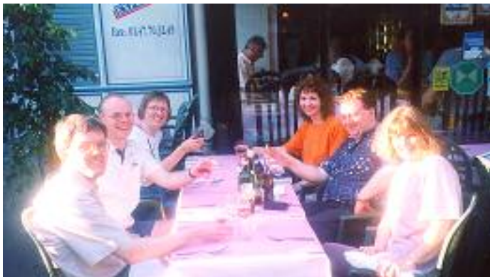
Taking a break for Dinner in Paris !